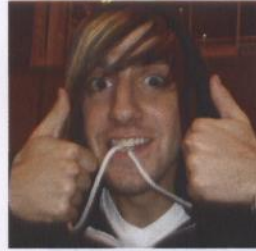
JACK BARAKAT ALL TIME LOW

"Today's all about Alkaline Trio for me. I've been into them since I was 14 and I just think they're great. They're the band I really want to see."