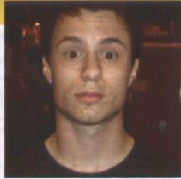
JOSH FARRO PARAMORE

"I think the line-up of this festival is a lot less hardcore than it used to be. It's got much more mellow. I'm having an okay time but I preferred it in the past."