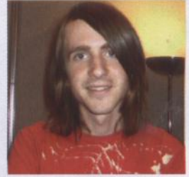
DEREK SANDERS MAYDAY PARADE

"This is my third year of travelling over from Gibraltar to see GIAN, so it's become something of a yearly tradition. I'm determined to have a great time."