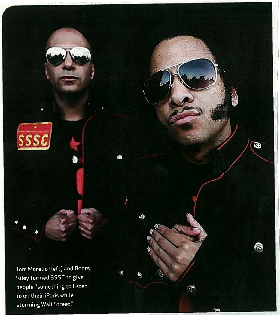
Tom Morello (left) and Boots Riley formed SSSC to give people "something to listen to on their iPods while storming Wall Street."