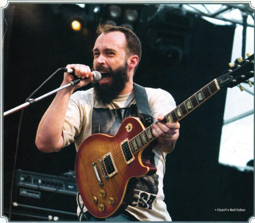
• Clutch's Neil Fallon