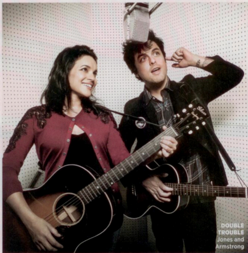
DOUBLE TROUBLE Jones and Armstrong

"That was the key to us - not to just copy the record," says Jones, who recorded Foreverly with Armstrong in New York over nine days this spring and summer. "Songs like 'Down in the Willow Garden' and 'Put