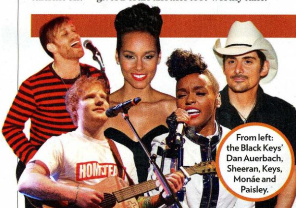
From left: the Black Keys' Dan Auerbach, Sheeran, Keys, Monáe and Paisley.

ALICIA KEYS FEATURING KENDRICK LAMAR "It's On Again" After a blistering spit from Lamar, A-Keys slicks it up with a lush, string-laden Pharrell production from The Amazing Spider-Man 2 soundtrack. Not super, but it still swings. ★★★