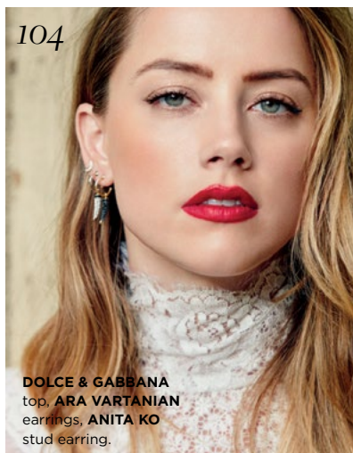
DOLCE & GABBANA top, ARA VARTANIAN earrings, ANITA KO stud earring.