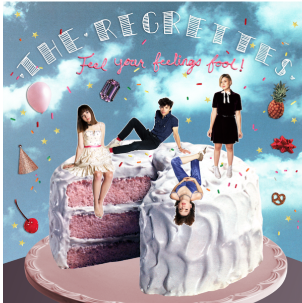
"Feel Your Feelings Fool" album art